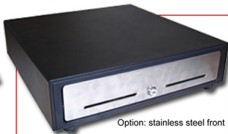
Option: stainless steel front